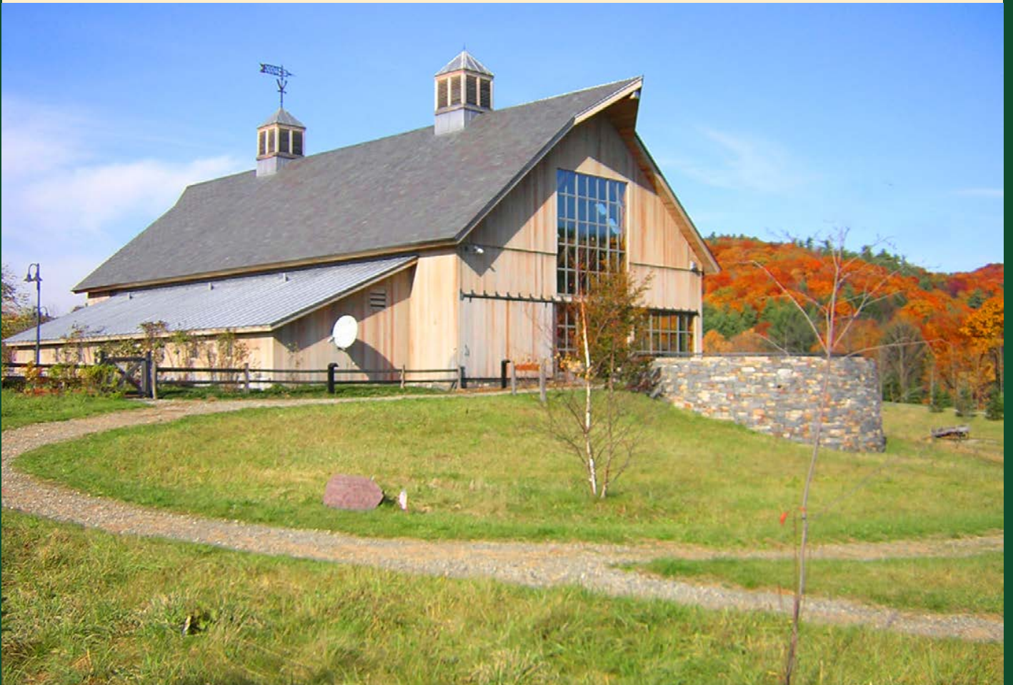
Guilford Welcome Center