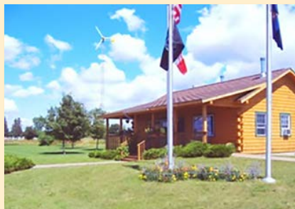
Alburgh Welcome Center Open May through October