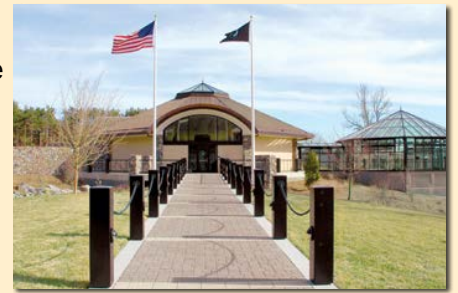
Sharon Welcome Center

The Vermont Information Center Division provides an excellent opportunity to capture the attention of over four million travelers who pass through our 18 centers statewide. Our centers provide you with a direct link to the traveling public, offering exposure for your products or services.