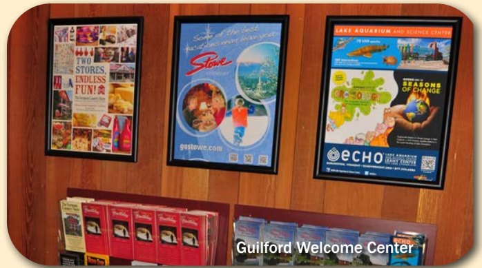
Guilford Welcome Center