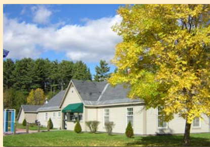
Waterford Welcome Center