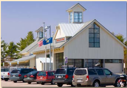
Williston North Information Center

The Vermont Information Center Division provides an excellent opportunity to capture the attention of over four million travelers who pass through our 18 centers statewide. Our centers provide you with a direct link to the traveling public, offering exposure for your products or services.