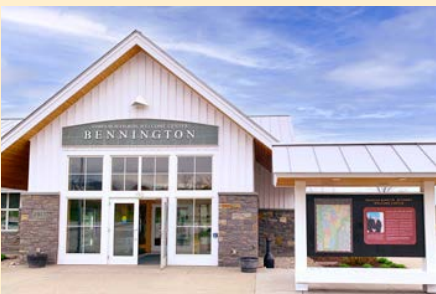
Bennington Welcome Center