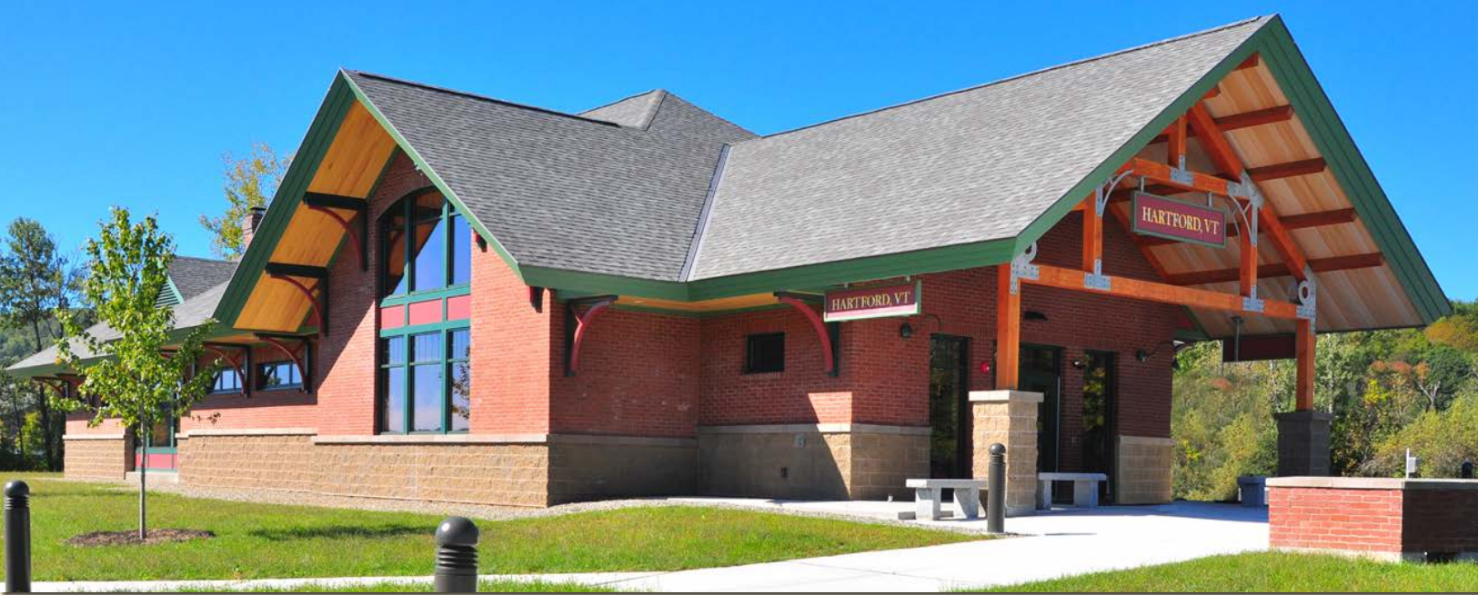
Hartford Welcome Center