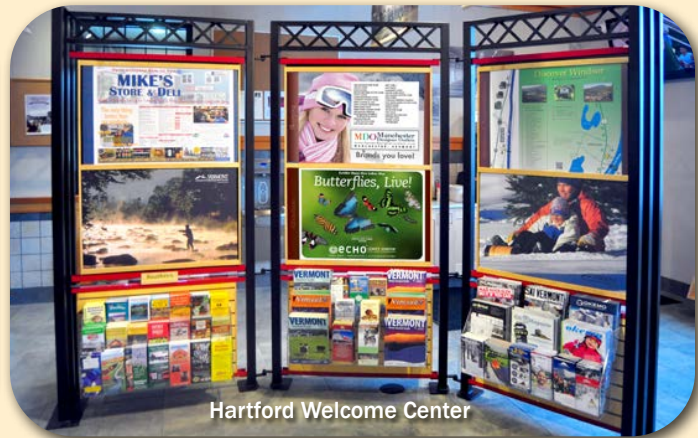
Hartford Welcome Center