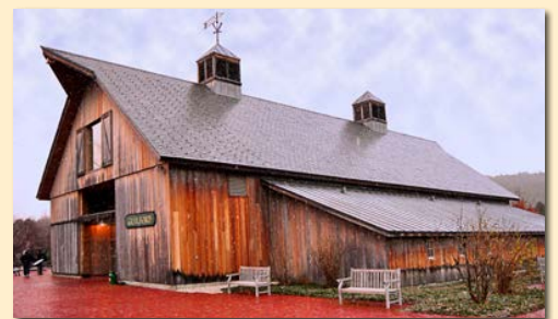
Guilford Welcome Center