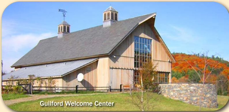
Guilford Welcome Center

In addition to the brochure display space, static wall ads are also available in the seven centers listed below. (See Print Media Rates Table). For more information please call Lisa Sanchez at 802-793-9918.