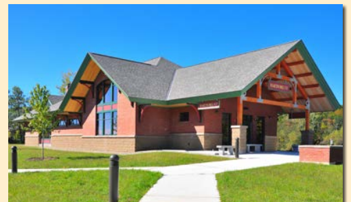
Hartford Welcome Center