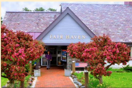
Fair Haven Welcome Center