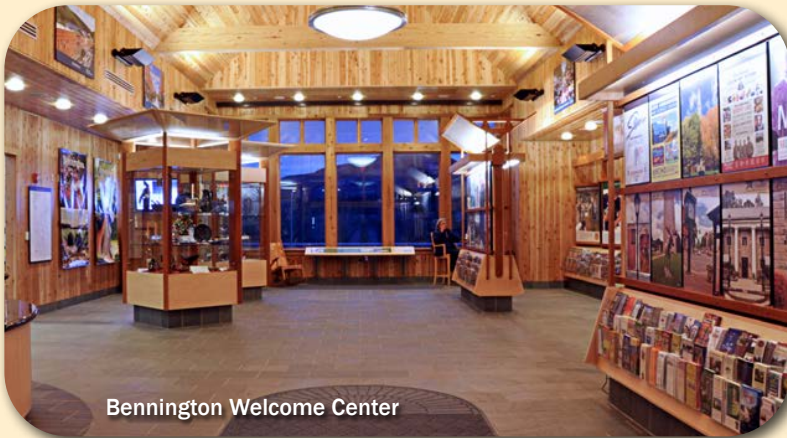
Bennington Welcome Center